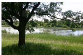
Christ Serve Ranch has at least 7 different biomes that demonstrate the diversity of Creation

Noted lecturer and Creation expert, Brian Young will lead youth, ages 10-15 , through the six days of Creation as described in